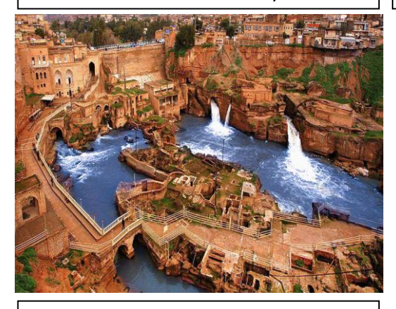
Shushtar Historical Hydraulic System(Khuzestan Province-Shushtar)