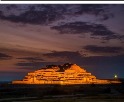
Chogha Zanbil (Khuzestan Province-Shush)