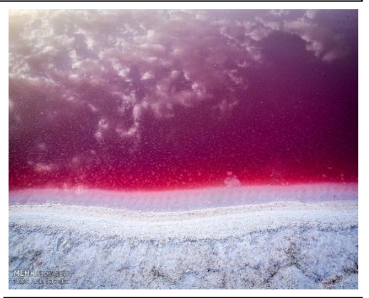
Maharloo Lake(Fars province)