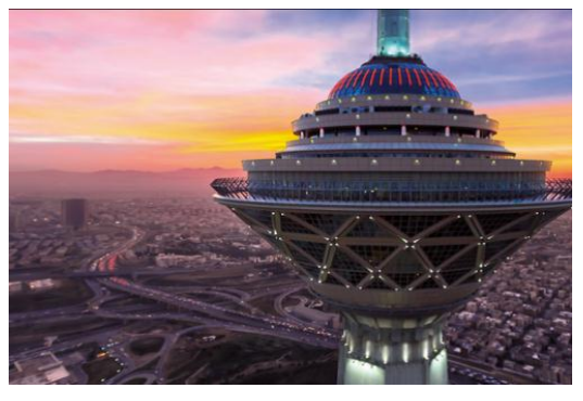
Milad tower(Tehran Province-Tehran)