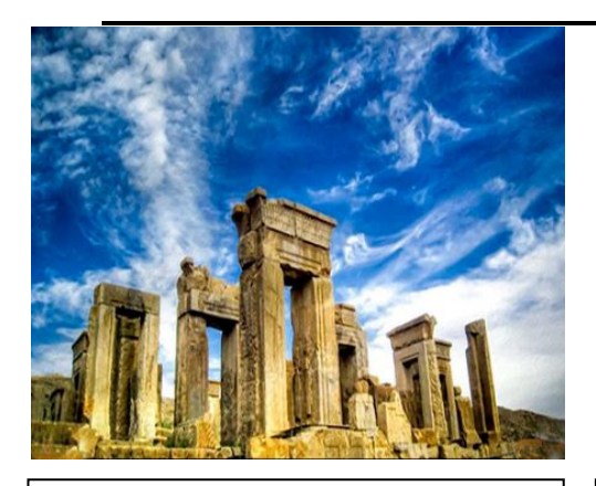
Persepolis (Fars province-Shiraz-Marvdasht)