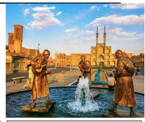
Amir Chakhmaq Squre(Yazd Province-Yazd)