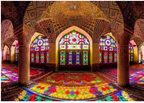
Nasir Al Molk Mosque(Fars province-Shiraz)