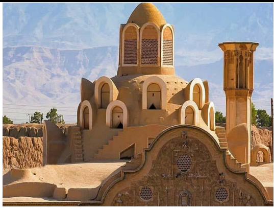
Boroujerdi House(Isfahan Province-Kashan)