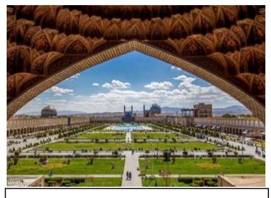
Naghsh-e Jahan Square(Isfahan Province-Isfahan)