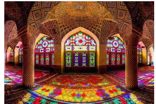
Nasir Al_Molk Mosque(Fars province-Shiraz)