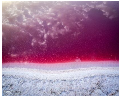
Maharloo Lake(Fars province)