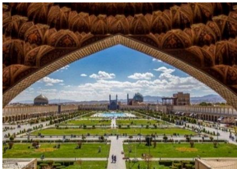
Naghsh-e Jahan Square(Isfahan Province-Isfahan)