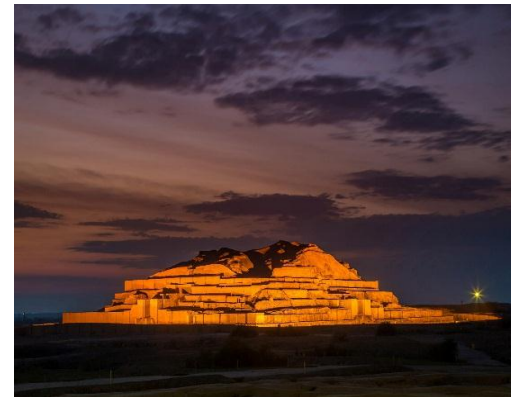
Chogha Zanbil(Khuzestan Province- Shush)