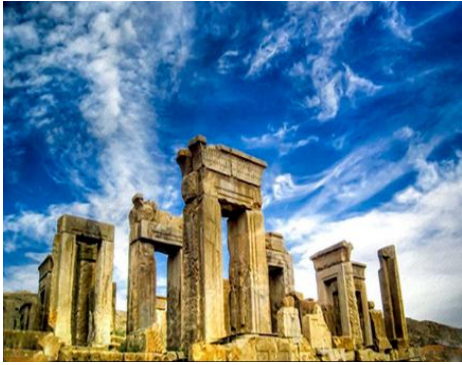
Persepolis(Fars province-Shiraz- Marvdasht)