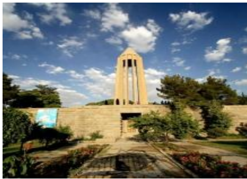
Tomb of Avicenna(Hamedan Province- Hamedan)