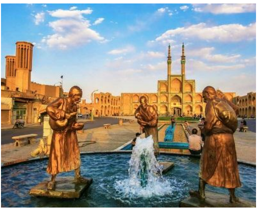
Amir Chakhmaq Squre(Yazd Province-Yazd)