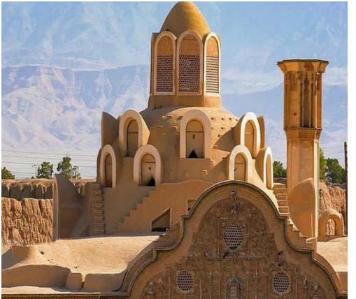
Boroujerdi House(Isfahan Province-Kashan)