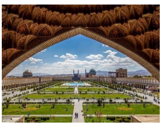
Naghsh-e Jahan Square(Isfahan Province-Isfahan)