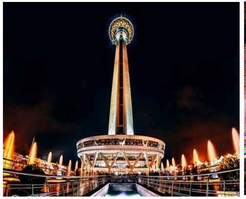
Milad tower(Tehran Province-Tehran)