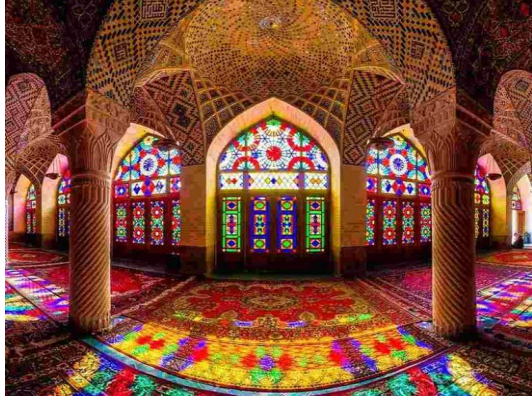
Nasir Al_Molk Mosque(Fars province-Shiraz)